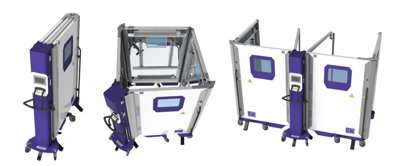
Figure 1 : The PurpleSun E300 FMUV system in PACT configuration for transport or storage (Left), CUBE configuration for surrounding smaller equipment (Center), and RECTAN mode for surrounding larger equipment (Right).